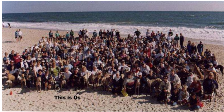
"Greyhounds Reach The Beach"—Dewey Beach, 1997

At 11:45 and 3:15 we will be taking a Keepsake Souvenir Group Photo.