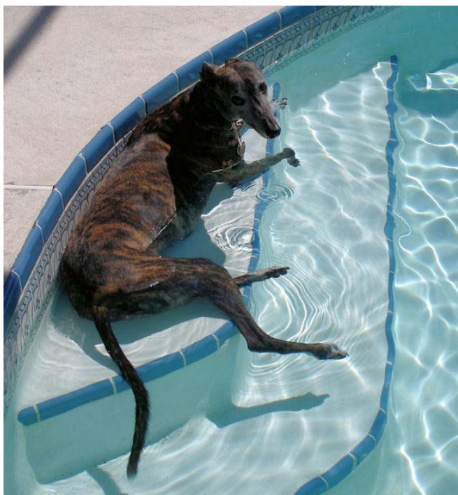
"Sandy in the Pool"

The newsletter of Northern Greyhound Adoptions! As a non-profit organization, NGA's aim is to integrate ex-racers into the surrounding communities. Each year, we strive to place 60 dogs. Dogs are welcomed into our kennel, and socialized with our volunteers and other greyhounds as they relax and adjust into their retirement years. Pursuing our mission, we work to educate the public and increase awareness of the greyhound.