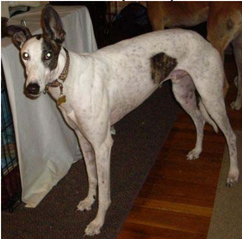
Bohemian Yahoo (aka Bo)

----- Next Issue – Meeting the rest of the new "Pack"