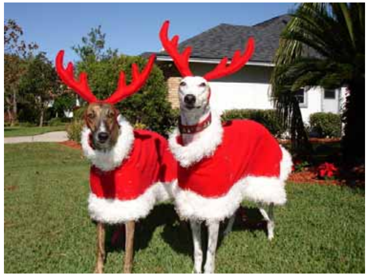
Gizzy & Specky - Winter Springs FL