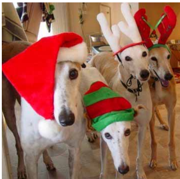
Ripley, Duncan, Allie & Lizzie – York, PA

The newsletter of Northern Greyhound Adoptions! As a non-profit organization, NGA's aim is to integrate ex-racers into the surrounding communities. Each year, we strive to place 60 dogs. Dogs are welcomed into our kennel, and socialized with our volunteers and other greyhounds as they relax and adjust into their retirement years. Pursuing our mission, we work to educate the public and increase awareness of the greyhound.